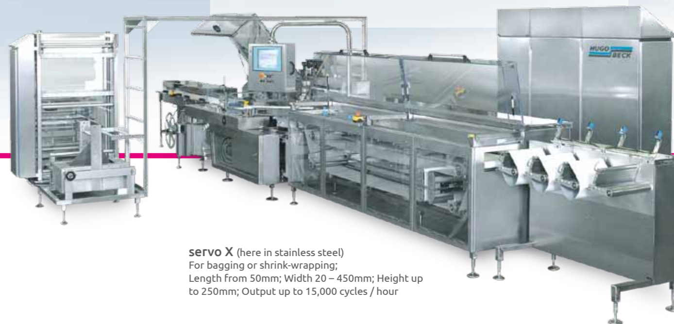
servo X (here in stainless steel) For bagging or shrink-wrapping; Length from 50mm; Width 20 – 450mm; Height up to 250mm; Output up to 15,000 cycles / hour