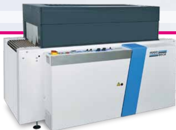
Shrink tunnel SL 5015/23